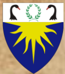
Barony of Aneala