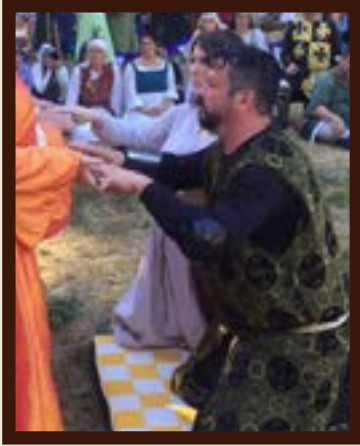
Their Royal Majesties of An Tir Count Savaric de Porte des Lions and Countess Dalla Hjalbaadsdottir