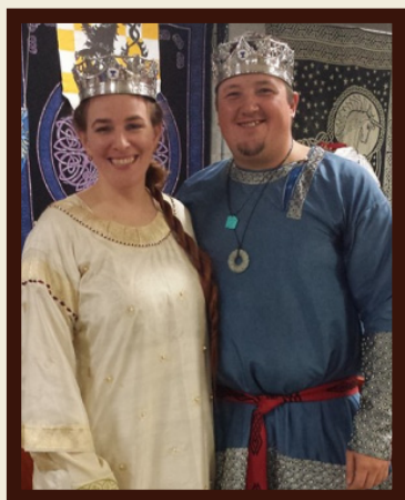
Their Highnesses of Summits, Prince Ziitos Turk and Princess Vestinia Antonia Aurelia